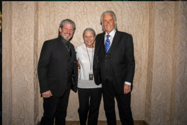
The Righteous Brothers